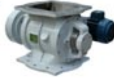
XGD Valve with Chain Drive