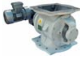
XGD Valve with Direct Drive